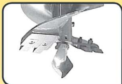
per modello for model TR 100/180/300

Punta Elicoidale con doppia elica, taglienti in acciaio antiusura imbulonati, per lavoro in medi terreni.